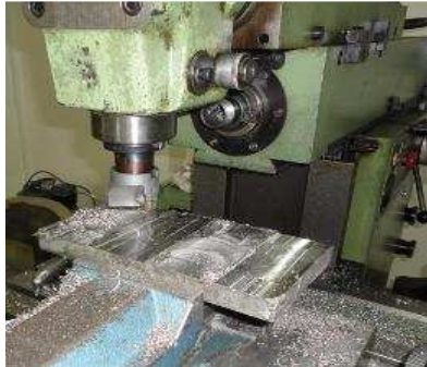
Fig. 1 actual machining operation

The experiments were performed in a Vertical milling machine (Tabriz co.) with a maximum spindle speed of 2500 rpm and 630 mm/min maximum feed rate. The machine had a 4.4 KW spindle motor. The actual machining operation is illustrated in Fig. 1.