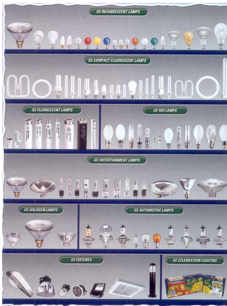
Fig. 5 Typical Spectrum of Lamps