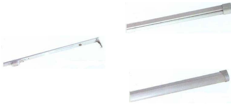
Fig. 2 Typical Consumer Luminaires for Fluorescent Lamps surface mountable