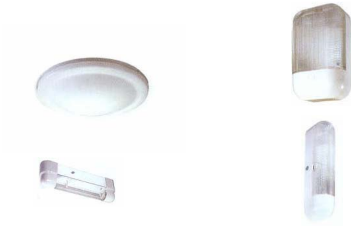
Fig. 1 Typical Decorative Surface mounting Consumer Luminaires