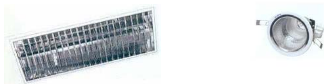
Fig. 4 Typical Commercial Luminaires using CFLs suitable for recessed mounting