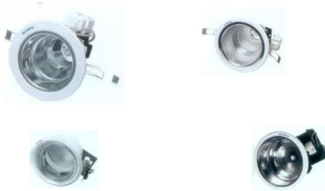
Fig. 3 Typical decorative Downlighters using CFL which can be recessed in ceiling