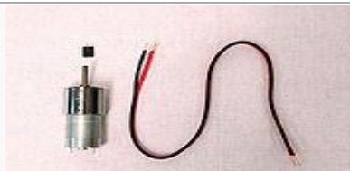
20mm gear motor