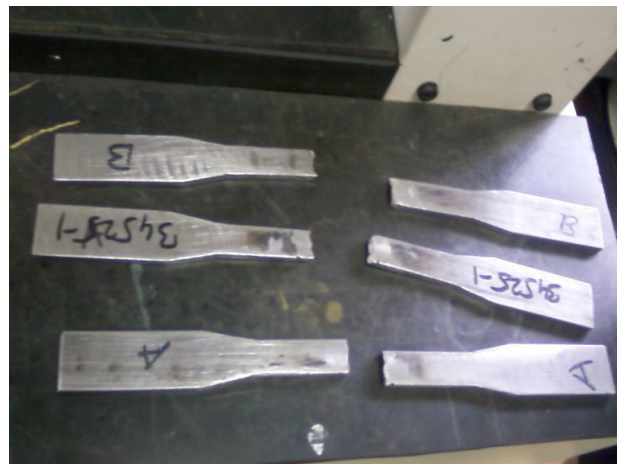
Figure 7 : Specimen after fatigue failure.