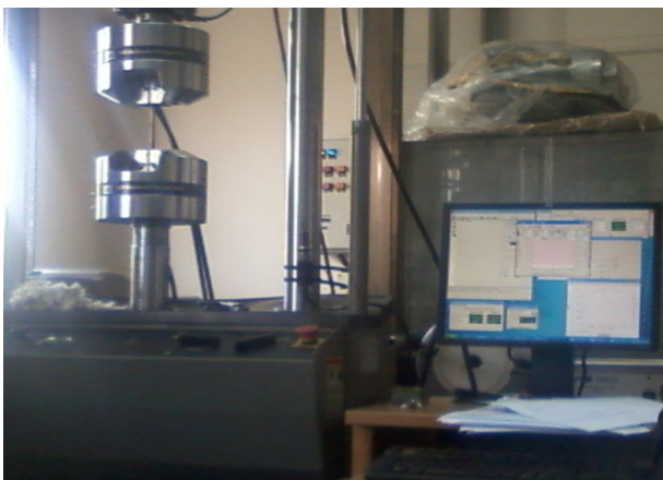
Figure 5 : Fatigue Testing of Specimen on MTS machine with Software Interface