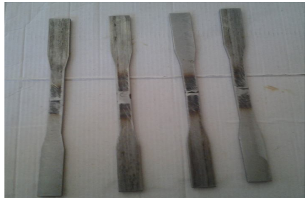
Figure – 6 : Specimen before fatigue failure

ASTM E399, E647, B645, E1820, ISO 12737, 12108, 12135