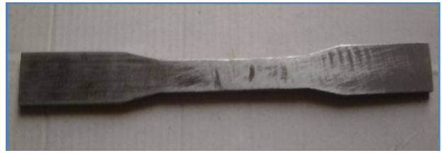
Figure 2 : Specimen prepared for fatigue Testing