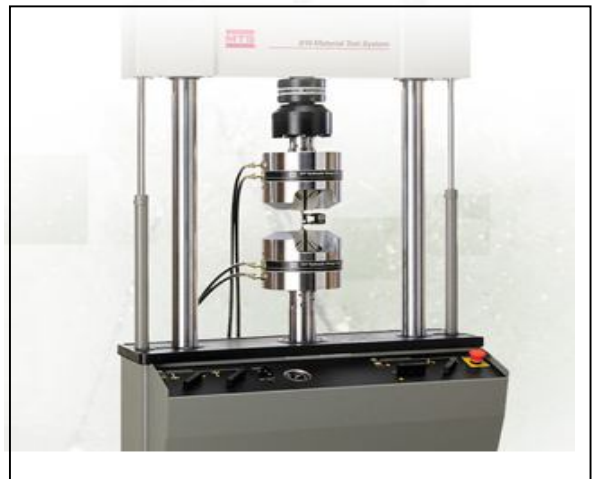
Figure 3 : Load Unit Specification and Fixture with CTOD Sensor