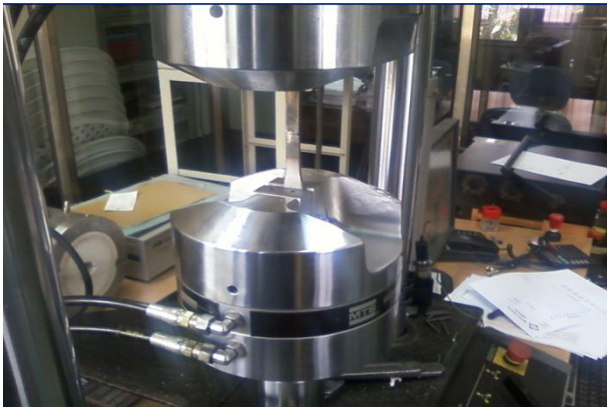
Figure 4 : Fatigue Testing of Specimen loaded on MTS machine