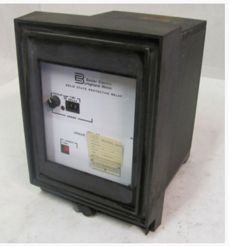
Basler Electric BE1-27 Solid State Protective Relay, Over/Under Voltage