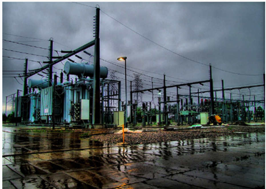
A substation as a part of an electrical generation, transmission, and distribution system

Should the network shut down, its re-energization may be accomplished by blocking the overcurrent relays and closing the circuit breakers of the supply feeders as simultaneously as possible . Batteries operating the closing mechanisms should be checked to ascertain sufficient output is available for satisfactory operation of the circuit