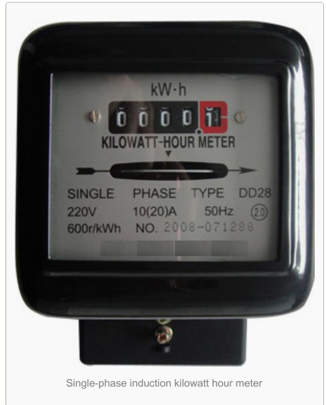
Single-phase induction kilowatt hour meter

The moving system essentially consists of a light rotating aluminium disk mounted on a vertical spindle or shaft. The shaft that supports the aluminium disk is connected by a gear arrangement to the clock mechanism on the front of the meter to provide information that consumed energy by the load.