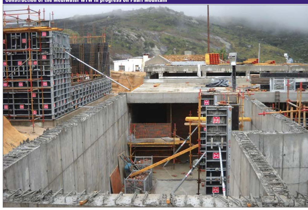
Construction of the Meulwater WTW in progress on Paarl Mountain

parallel lateral under-drainage system, disinfection with chlorine, and stabilisation with lime.