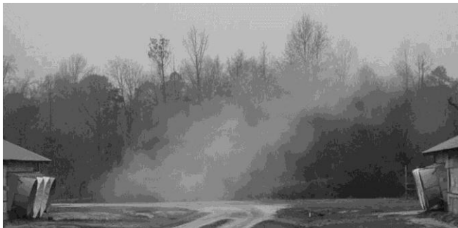
Figure 2 Air emission plume from a tunnel ventilated poultry house

For this theoretical study, PM emission from an animal housing ventilation system was used as an example to investigate Gaussian dispersion model predictions of downwind concentrations under different case scenarios. As shown in Figure 2, although the emission “stack” of the housing ventilation fans was near the ground level (1.5 m above the ground), the exhaust plume may reach the top of the background trees (14 m high). The plume-rise of the air emissions from this animal housing system was caused by velocity momentum of the exhaust fans and the thermal lifting of the exhaust air due to temperature difference between emitted air and surrounding air. Thus, the plume-rise of air emission from animal housing system is a function of the exhaust ventilation fan flow rate and the temperature difference between the exhaust air and the ambient air. Consequently, the plume rise varies over different seasons and under different ventilation settings.