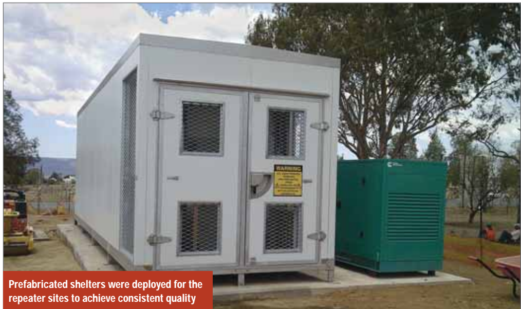
Prefabricated shelters were deployed for the repeater sites to achieve consistent quality

The tender process to identify and appoint a technology partner with the appropriate construction and telecommunication transmission technology