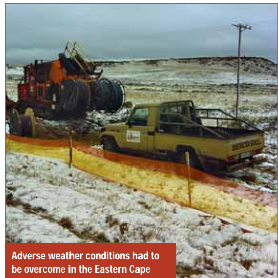
Adverse weather conditions had to be overcome in the Eastern Cape