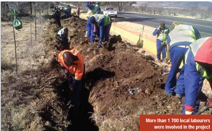
More than 1 700 local labourers were involved in the project