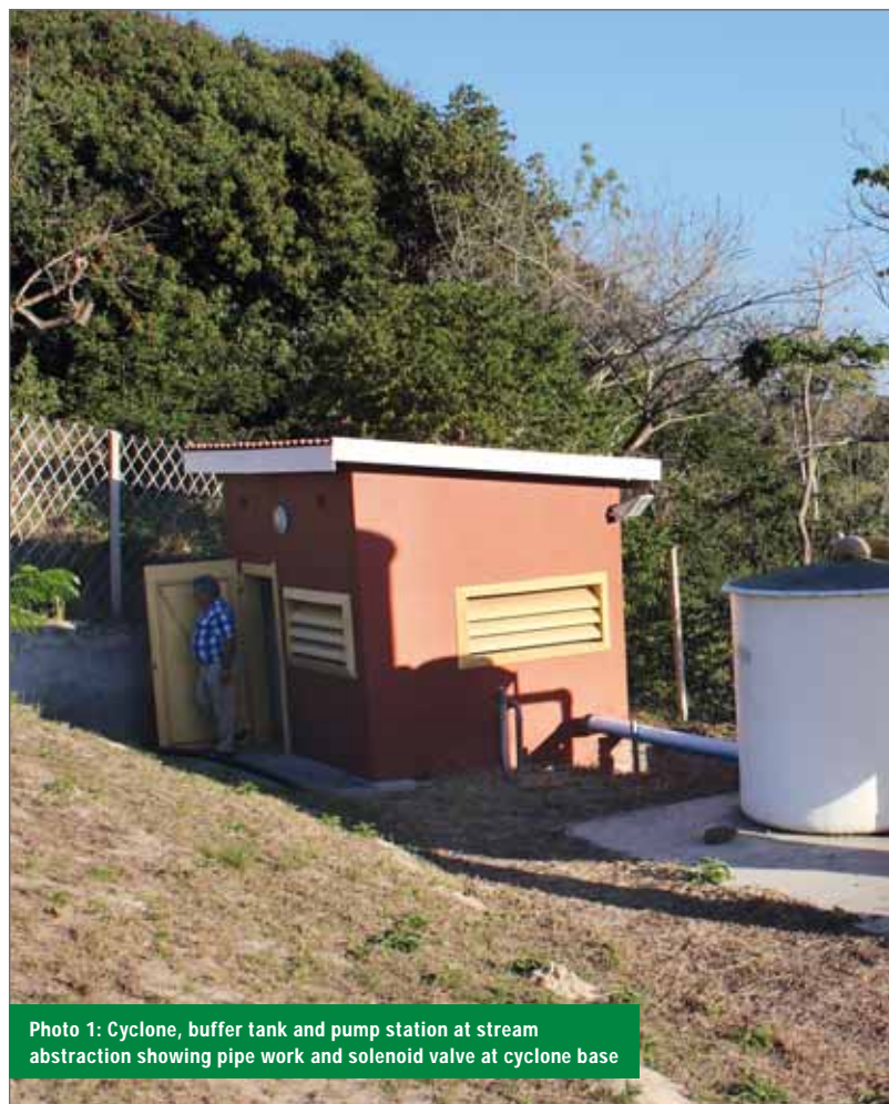
Photo 1: Cyclone, buffer tank and pump station at stream abstraction showing pipe work and solenoid valve at cyclone base

The main civil contracts were awarded to Afriscan Construction Pty (Ltd) in March 2007 on the Enkanyezini Phase 2 scheme, and Hidrotech Infra Pty (Ltd) in August 2007 on the Kwangwanase Phase 3 scheme. These contracts were completed in March 2010 and June 2011 respectively.