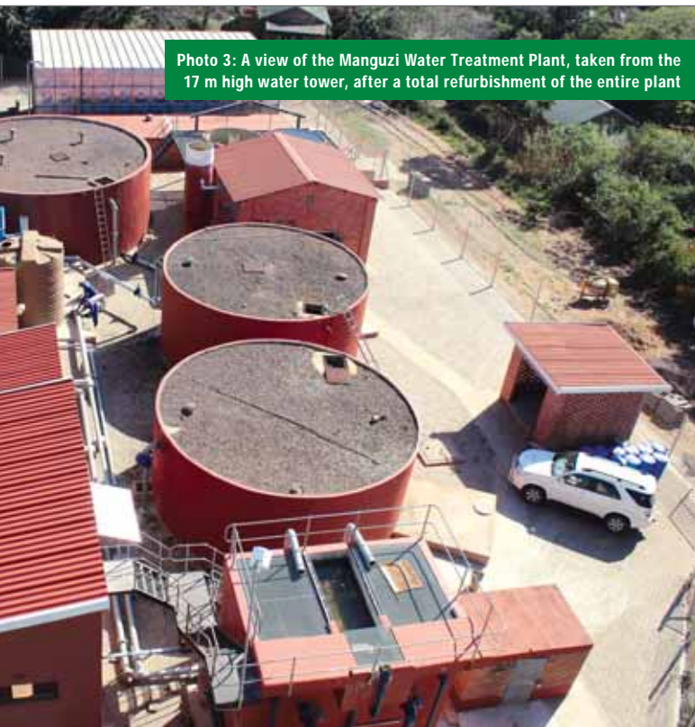
Photo 3: A view of the Manguzi Water Treatment Plant, taken from the 17 m high water tower, after a total refurbishment of the entire plant