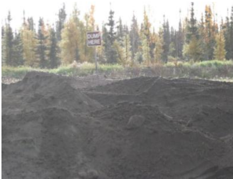
Eielson asbestos and coal ash landfill