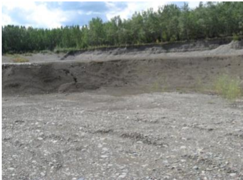
Clear AFS landfill with coal ash