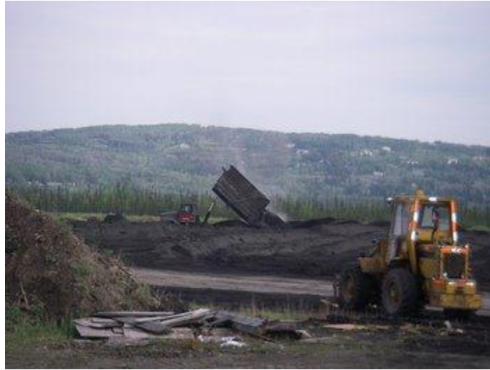
UAF disposal site for CCW