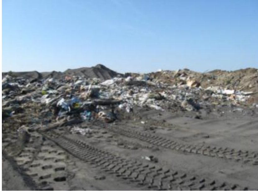
Fort Wainwright landfill