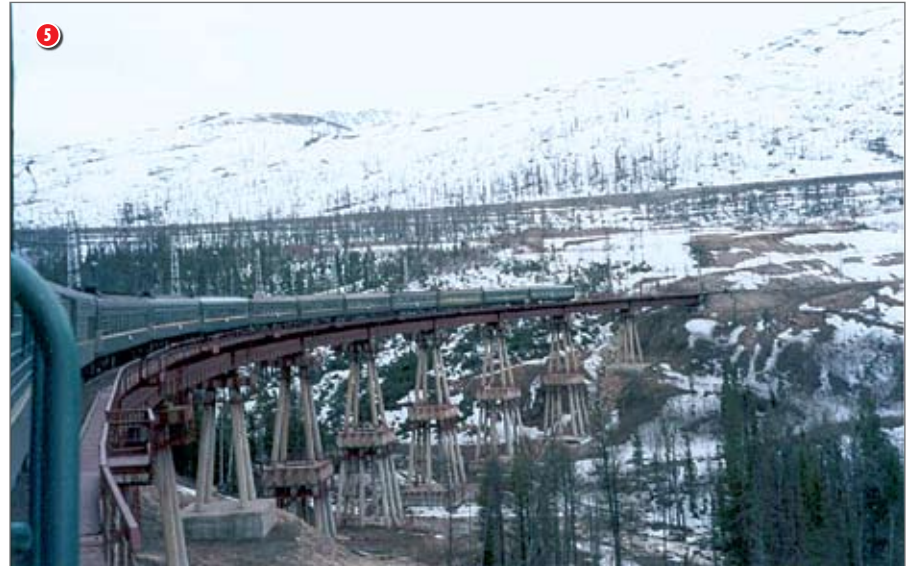
(devil's bridge) viaduct, where train drivers allegedly crossed themselves before entering the bridge, is situated at a steep gradient turn