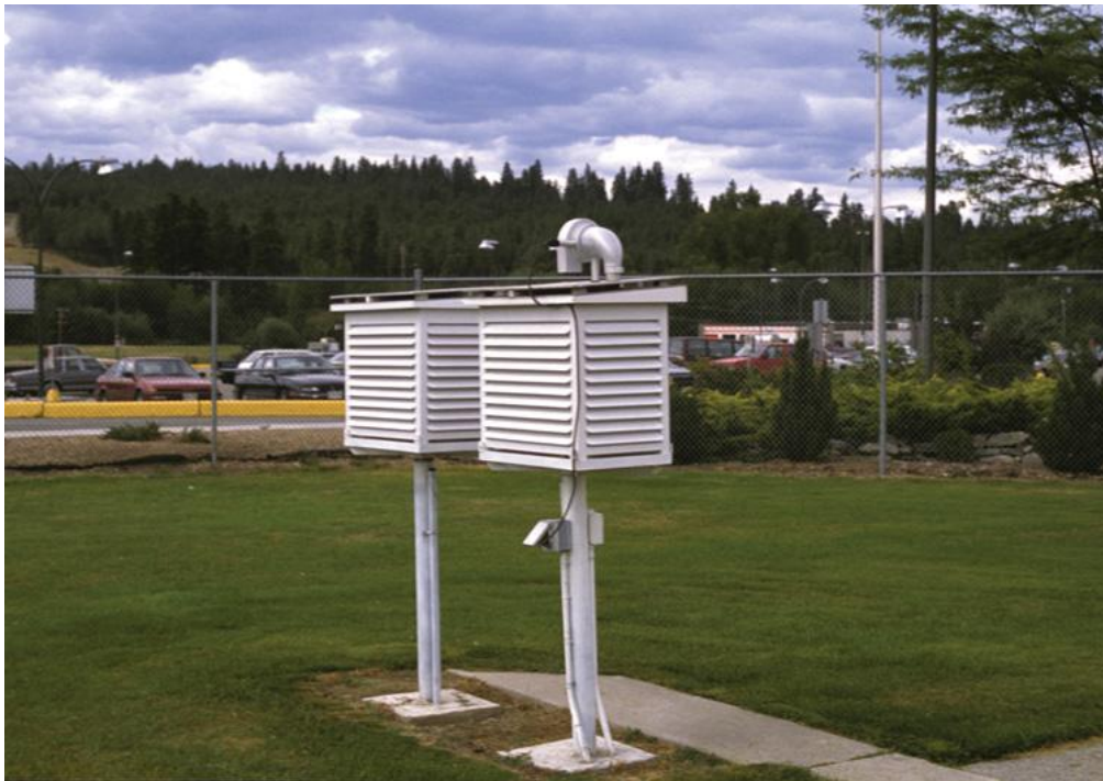
Figure 2: Stevenson Screen meteorological instrument shelters. These shelters are typically made of wood, painted white, and have louvered sides. They also are elevated to height of about 1.5 meters (about 4.5 feet) by a wooden or metal base. Some instrument shelters have an electric fan attached to them for better air circulation in the instrument box during light wind conditions.

By international agreement, the nations of the world have decided to measure temperature in a similar fashion. This standardization is important for the accurate generation of weather maps and forecasts, both of which depend on having data determined in a uniform way. Weather stations worldwide try to determine minimum and maximum temperatures for each and every day. By averaging these two values, daily mean temperatures are also calculated. Many stations also take temperature readings on the hour. Temperature measurements are determined by thermometers designed and approved by the World Meteorological Organization. These instruments are housed in specially designed instrument shelters that allow for the standardization of measurements taken anywhere on the Earth (Figures 2, 3 and 4).