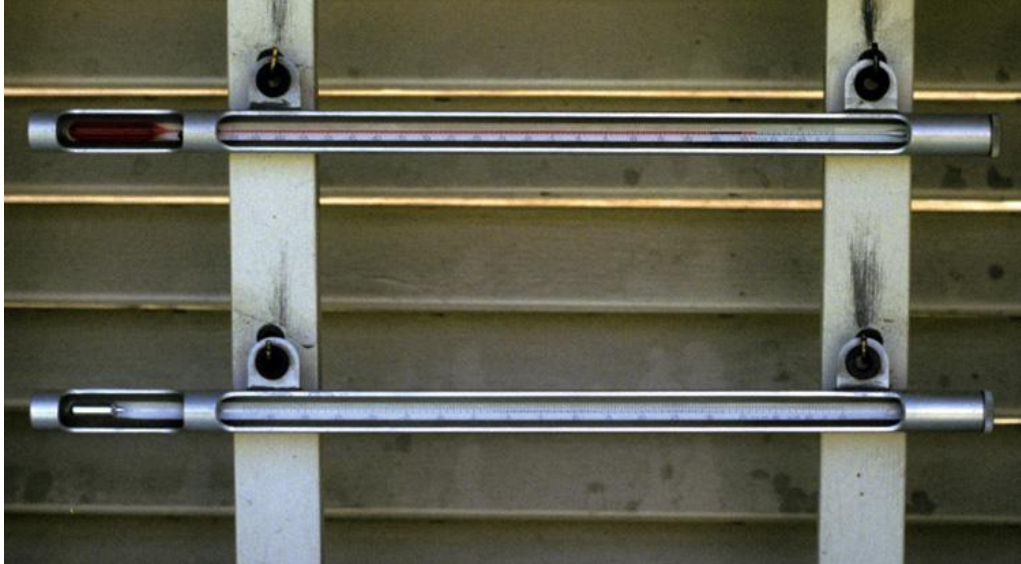
Figure 3: Thermometers found inside the instrument shelter are mounted approximate 1.5 meters above the ground surface. The top thermometer contains alcohol and is used to determine daily minimum temperatures. The lower thermometer uses mercury to determine the daily maximum temperature.