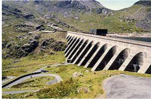
Ffestiniog pumped storage facility, Wales.

Hydroelectric power can be viewed as the conversion of potential energy of water situated at a higher elevation engaging in fall to yield kinetic energy that drives a water turbine, which in turn produces electricity by a generator. Thus the energy extracted from the falling water depends on the water volume and on the difference in height between the elevated source and the position of the turbine. This height difference is called the hydraulic head, the potential energy being proportional to the head. To deliver water to a turbine a large pipe called a penstock is often employed.