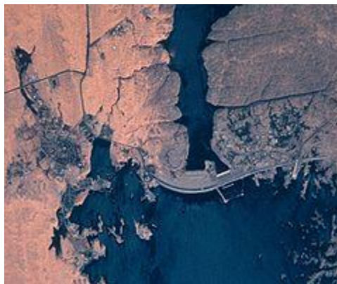
Aswan High Dam viewed from space.

The useful life of a hydroelectric project can be measured by its engineered elements or by its rate of sedimentation. Efficiencies and improvements in design of the power plant and hydraulic elements can almost indefinitely expand the useful engineering life of the equipment; however, sedimentation is an inherent limiting factor of the hydroelectric facility. Moreover, dredging or weir construction can add to the useful life of a project, even though the energy and environmental consequences of dredging may outweigh the benefits of