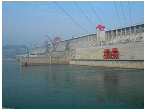
Three Gorges Dam, Yangtze River, China.

Hydroelectricity is electricity generated by converting the kinetic energy of falling or flowing water. It is considered the most widely installed form of renewable energy , although most large dams have a finite lifetime unless dredging of silt is periodically conducted. Hydroelectricity has and has a considerably lower output level of the greenhouse gas carbon dioxide than fossil fuel powered energy plants, and less life cycle greenhouse gas impact than solar power . Furthermore, the ecological impacts of hydropower is arguably greater than any form of energy production, due to the large footprint of biological impact of reservoirs and other needed developed areas. Worldwide, an installed capacity of 777 Gigawatts was catalogued in the year 2006, sufficient to supply one fifth of the world power supply. Since most of the prime locations for hydroelectric power have been tapped, the promise for new installed capacity is limited.