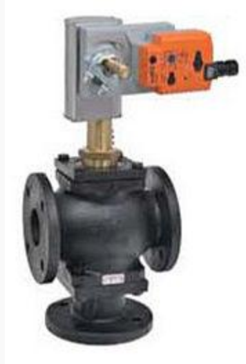
Fail Safe Actuators

Fail Safe Actuator is for larger valves with higher torque requirements, requiring reliable fail safe operation utilizing a unique in-built air reservoir giving fail safe action without the torque losses inherent of spring designs. By using the time proven air accumulator system, and modern design techniques, produces air chamber modules with all the pneumatic circuitry safety protected within.