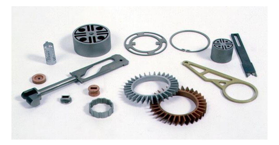
Figure 3: Difficult internal parts made by EDM process

The EDM process has the ability to machine hard, difficult-to-machine materials. Parts with complex, precise and irregular shapes for forging, press tools, extrusion dies, difficult internal shapes for aerospace and medical applications can be made by EDM process. Some of the shapes made by EDM process are shown in Figure 3.