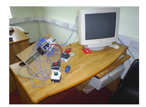
Figure 2 Training system and PC.