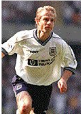
Figure 1: A very fine footballer