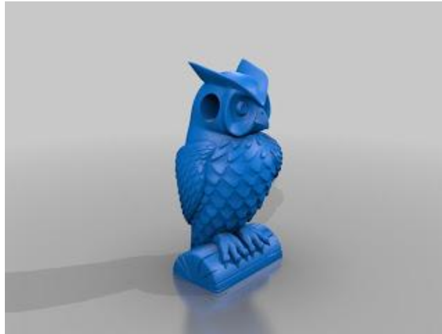
Owl necklace for: Download from Thingiverse

Or to discuss another example, we can create the mold so that the jewel of our dreams, in silver, gold, or other metal, with few limitations, the possibilities are almost endless.