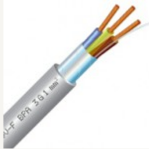
Twisted armoured cable

The manufacturer, which sales linked to armored equipments increase each year of more than 40%, tries to challenge distributors of electrical equipment and electricians about their duty of confidentiality with respect to “classic” electrical installations. “In France, the market remains still very low outside the habitat” tempers Olivier Granjon, sales engineer in the Group Omerin(2). “As providers we encounter a certain ignorance of the physical, technical solutions and a brake on the extra cost.”