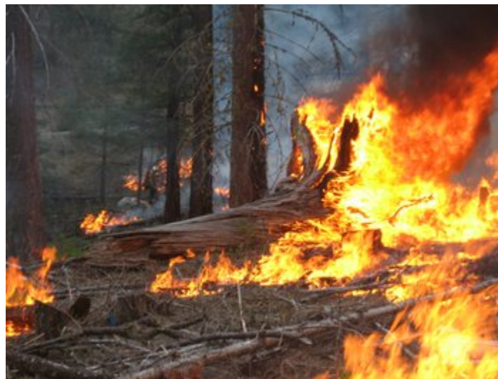
Fire burns through a ponderosa grove in northern Washington State, in a controlled burn. The primary author participates as a USFS firefighter.