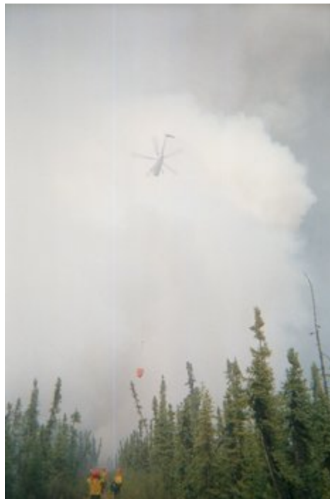
Helicopter water-drops help a crew contain a fire's hot edge

For instance, drought might render trees vulnerable, resulting in increased infestation rates and tree mortality. Wildfire then burns hotter and more aggressively with so much dead wood available, reducing timber acreage and creating younger forests while suppressing the infestations by destroying the insect larvae, their homes, and their food source. The cycle can also work in reverse: The U.S. Forest Service (USFS) has noted that spruce beetle outbreaks are often encouraged by fire and wind damage of forests. The tree-kills from the pest outbreaks then, of course, provide fuel for more wildfires.