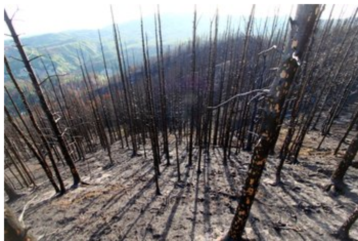
Burnt-Out Black Spruce

Our knowledge of fire history in Alaska is, however, incomplete. Historic records are of limited quality, due to incomplete fire reconnaissance through much of the state's history. Our prehistoric knowledge of fire in Alaska relies on such clues as soot layers in the soil and the study of tree rings (dendrochronology). Lightning-strike sensing and better aerial reconnaissance have helped improve the fidelity of Alaska's fire sensing in recent history, but records are apt to be of particularly low quality in remote areas where fires self-limit and burn out quickly.