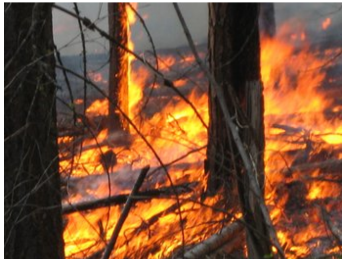
Fire burns through thick conifer slash, its heat moderated by cool autumn temperatures.

In contrast, "hot" fires tend to occur in hot, dry, and often windy conditions. They usually require large concentrations of receptive fuels and can be very fast-moving and transient (such as in tall grass) or slow-spreading and oven-like (in the case of heavy dead-and-down timber). In the boreal forest, warm summer temperatures and wind can combine to drive fire through closely spaced black spruce trees, creating a fast-moving hot fire that is primarily carried in the tree canopies, not on the ground.