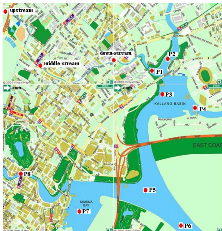
Fig. 1 Map of the sampling areas showing sampling sites