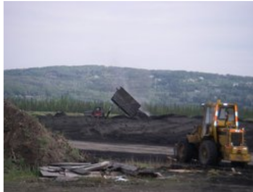
UAF disposal site for CCW

Coal combustion wastes (CCW) include ash, sludge, and boiler slag left over from burning coal to make electricity. These wastes (120 million tons/year in the US) concentrate toxins such as arsenic, mercury, chromium, cadmium, uranium and thorium. In addition, these wastes create an expensive storage problem "in perpetuity". Coal combustion emissions released into the atmosphere contain nitrous oxides which are responsible for industrial and urban smog, sulfur dioxide which is the primary reactive agent behind acid rain, mercury which accumulates in the food chain, and large amounts of carbon dioxide which is the most important greenhouse gas contributing to climate change. Coal mining itself also releases significant amounts of methane, another extremely potent greenhouse gas. Coal mining is responsible for over 25% of the energy-related methane emissions in the US.