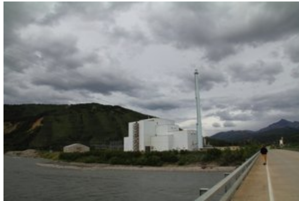
The HCCP plant near Usibelli coal mine

Some of the simplest economic costs of coal come in the form of subsidies and tax breaks which are not reflected in the market price of coal (for example the estimated $4.6 billion in coal-related subsidies in the 2009 stimulus package). Coal mining and combustion projects require major investments, and the risks and costs of those investments are often passed on to taxpayers via infrastructure subsidies and loan guarantees. An extreme example of this is the Healy Clean Coal Plant (HCCP), which has cost the State of Alaska and the Federal Government nearly $300 million since the mid 1990's yet is not producing power in return. Similarly, a recent study in Kentucky determined that the government spends $115 million more on subsidies for the coal industry in the state than it receives in taxes or other benefits. We have calculated that coal pays only 5% of it's market value to the state of Alaska, even though the nominal rates are much higher.