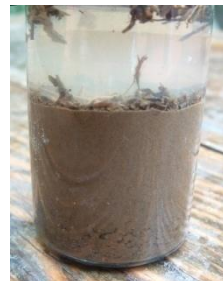
Right: Organic material floating on top

The organic matter (what is in topsoil) doesn't settle. It will keep floating in the liquid on top. If there is more than a tiny amount floating on top in your bottle, dig deeper for your sample and retest.