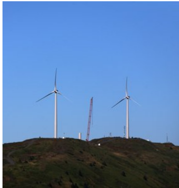
Each of these turbines produces up to 1.5 MW of electricity