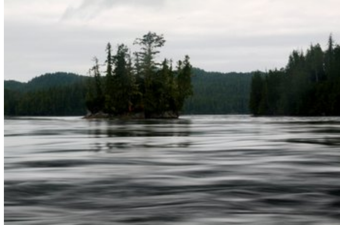
Deep water pours through this tidal rapid draining Seymour Inlet.