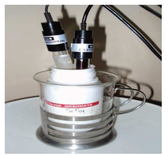
FIG 3: Potassium Sensor electrode and reference electrode are immersed in 10<sup>-3</sup> M buffer solution

Water-soluble Potassium is extracted from dried soil samples by dispersion in de-ionized water and analyzed by direct potentiometer.