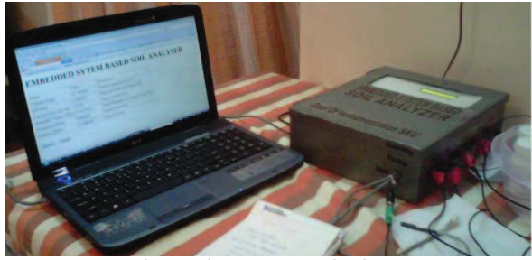
Fig:2 Local PC interfaced with ESBSA

different parameters. In this paper the estimation of Potassium present in the soil sample is explained. The ESBSA is connected to local computer via Ethernet port using RJ45 Ethernet cable. Then internet is provided to the local PC, Apache Web Server Software is used to configure the PC and made the local PC as Web Server. Using this software proxy pass and proxy reverse operations are provided to have online communication. Now the local system is ready to communicate the information online. Therefore, with the ESBSA, measured and calibrated data can be accessed globally.