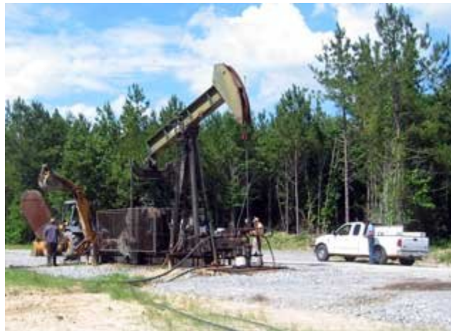
Coalbed Methane drilling rig (Louisiana)