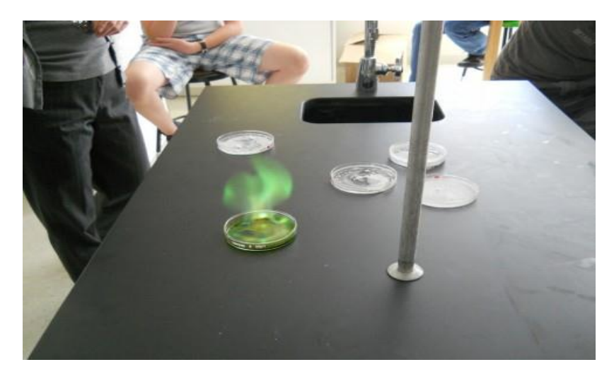
Copper burns green.

Elements can be identified from the color of light they give off when they're ionized: their emission spectra. Ms. Wilson's chemistry class today set fire to some metal salts to watch them burn.